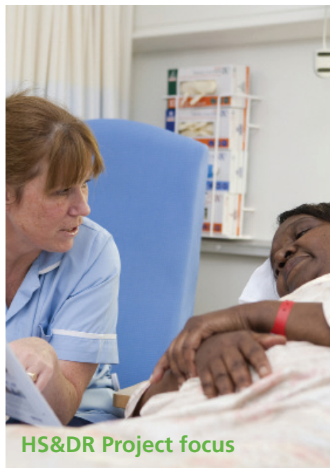
HS&DR Project focus

Eligibility and funding information is printed on the back cover of this leaflet. However, applicants should always check the programme website and call specification documents for full details of eligibility requirements.